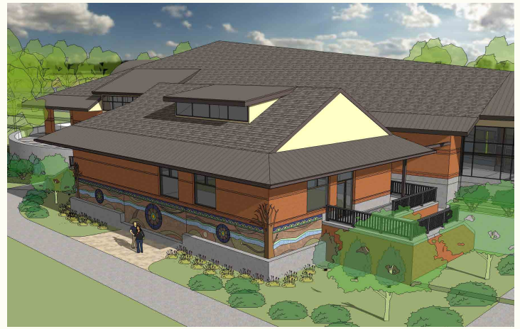
West Side View & Salem Peace Mosaic

Building plans and illustrations by Arbuckle Costic & Company